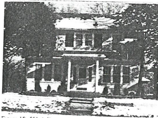
Figure 10: 501 Arlington Avenue

A good example of a Dutch Colonial Revival house with a side-facing gambrel roof is at 501 Arlington Avenue, built in about 1925. As is typical of this sub-type, the second floor windows are actually part of a long shed dormer within the lower portion of the gambrel roof. Another common feature is the front portico with Tuscan columns and front door surrounded by sidelights. Windows are six- or eight-over-one, wood double-hung sash with shutters on the upper floors.