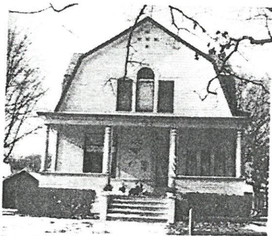
Figure 9: 470 Arlington Avenue

Dutch Colonial Revival houses are a type of Colonial Revival house marked by a gambrel roof (a steeply pitched gable roof with two planes on the slope). Generally faced in shingle or wood clapboard, they are derived from early Dutch houses built in the northeastern United States in the 1600s and 1700s. These revival style Dutch Colonial houses were built over a long period, as were other Colonial Revival houses, generally from 1880 to 1955. Most of these houses have a symmetrical front facade and a classical entry portico or porch columns that are characteristic of the Colonial Revival period.